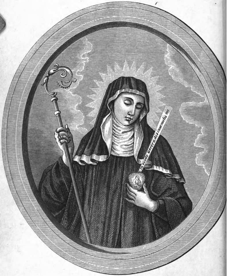
ST. GERTRUDE THE GREAT.

Engraved from the Spanish miraculous Painting.